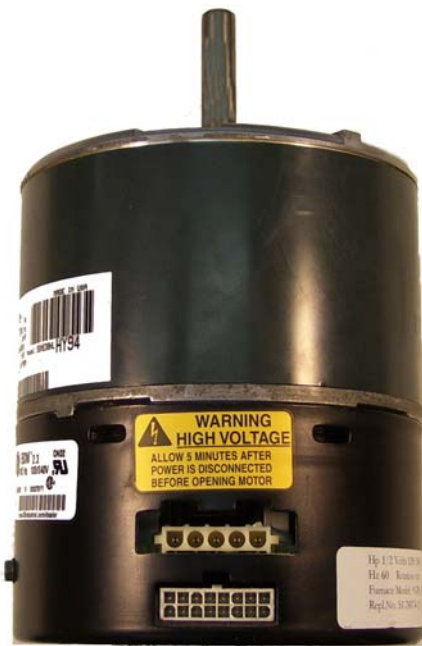
Variable Speed Motor

Don't Throw This Motor Away! Quickly Repairs Modules!