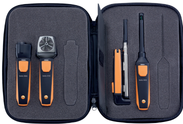
VAC Smart Probe Kit: 0563 0003