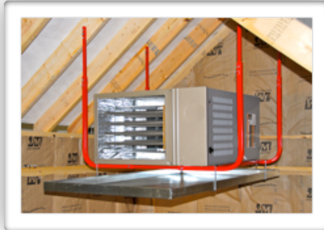
Quick-Sling SPECS QSLG2000

Applicable for residential or light commercial installations