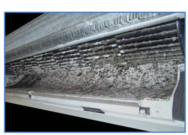
Mini-Split blower with MOLD