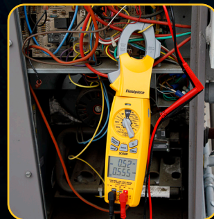
Measures Power (kW)