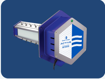
The Active 12" is suitable for residential and commercial applications.