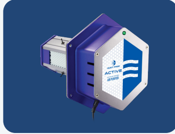
The Active 6" for residential applications up to 2.5 tons.