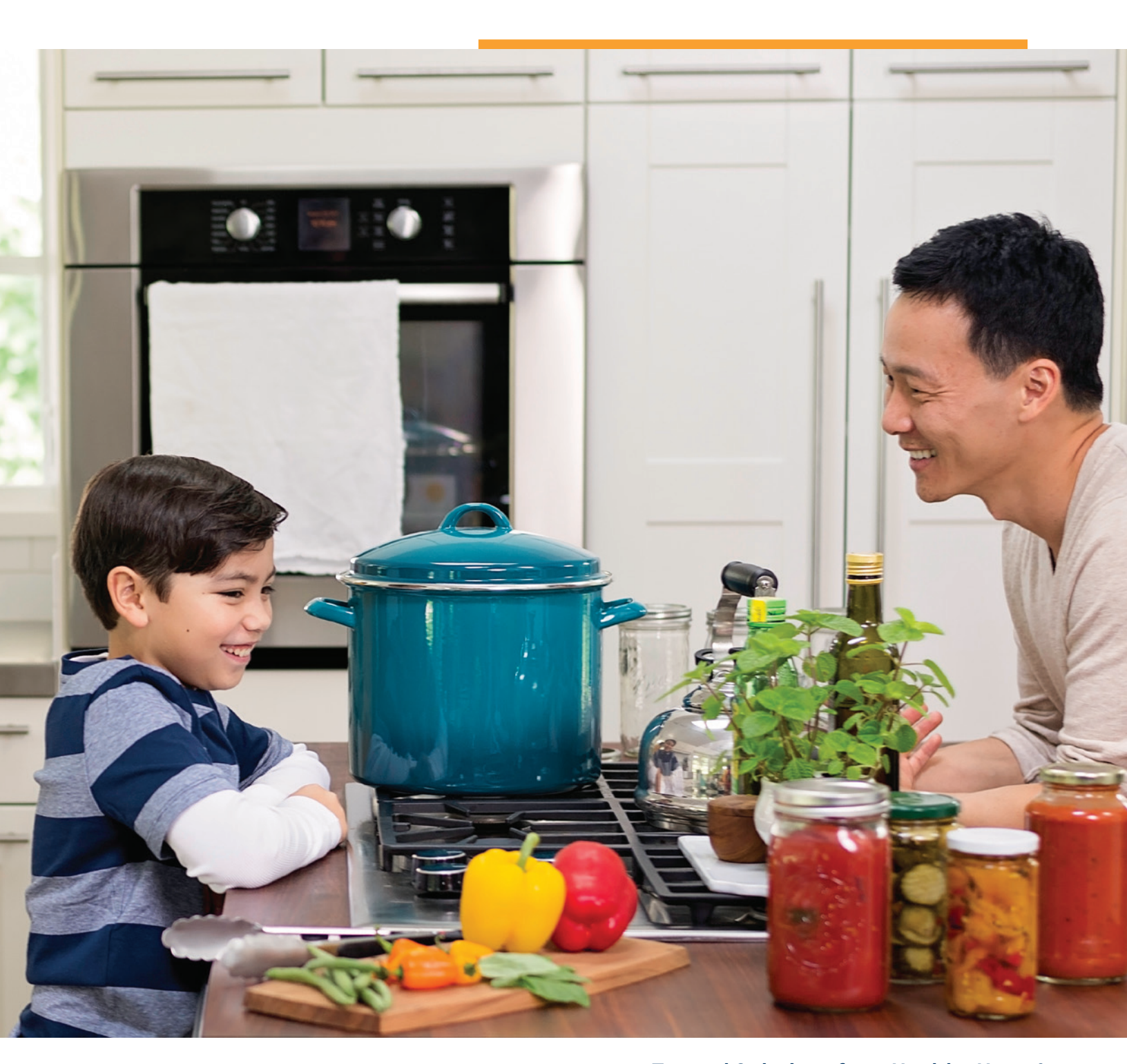
Trusted Solutions for a Healthy Home®