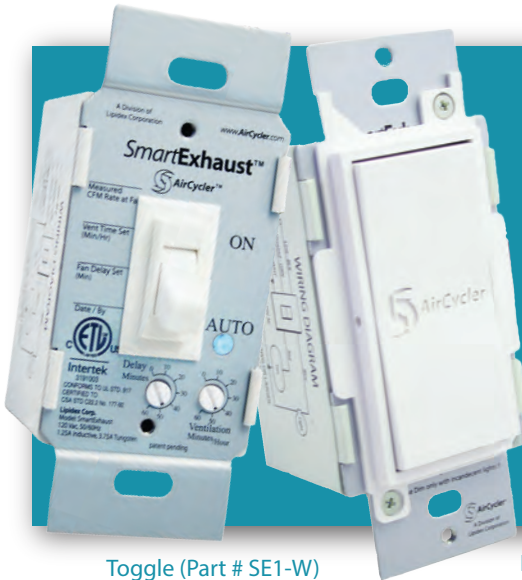
Toggle (Part # SE1-W)

The SmartExhaust™ Bath Fan/Light Switch is a simple and efficient solution for achieving adequate bathroom ventilation and meeting exhaust ventilation requirements. The SmartExhaust™ is designed to replace the bathroom fan and light switches with one smart controller and features programmable settings for running the exhaust fan as much or as little as you want, automatically.