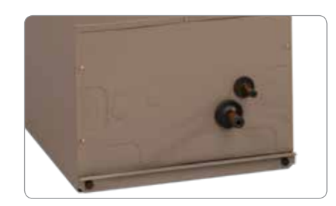
Filter rack door with thumb screws for easy access and replacement