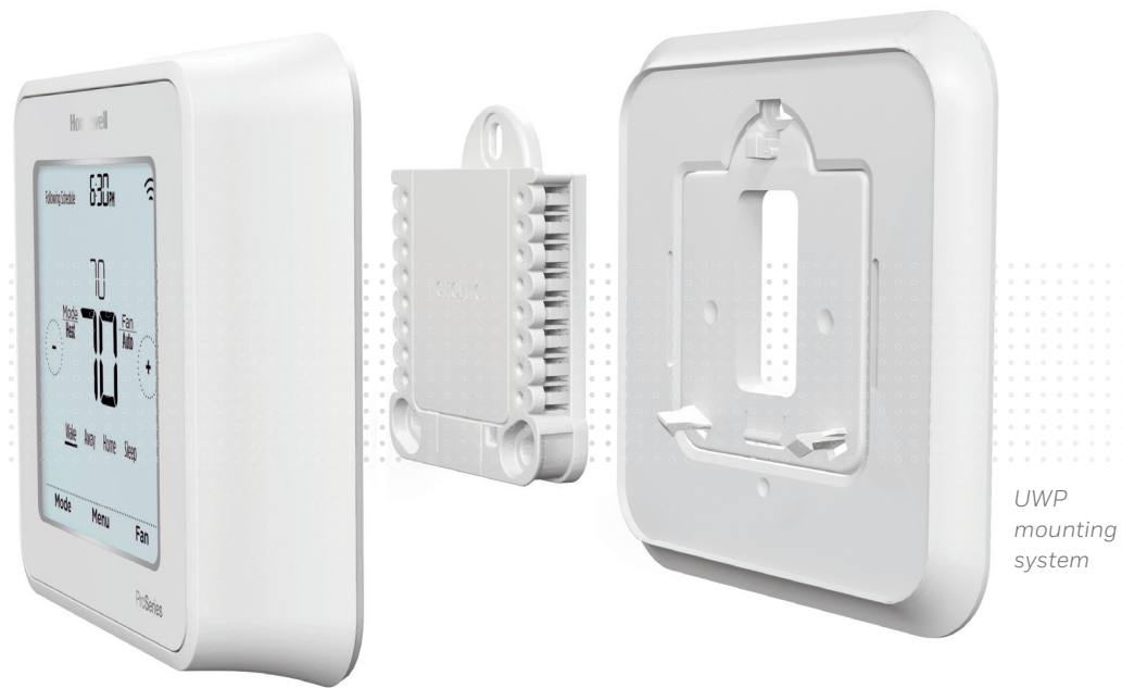
UWP mounting system