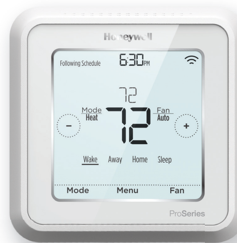
Lyric™ T6 Pro Wi-Fi

The Lyric T6 Pro Wi-Fi seamlessly integrates with Apple® HomeKit™, Amazon Echo® and more for customers who want to control all their smart home devices from a single app. See the ever-growing integration list at forwardthinking.honeywell.com/ecosystemintegrators .