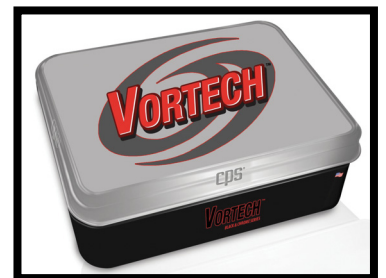
Custom packaging for a custom tool